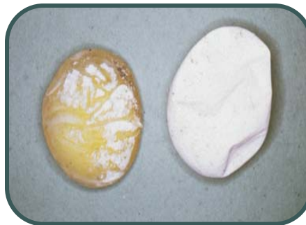
Eggs from hen with IB infection showing abnormal shell formation and soft egg shells