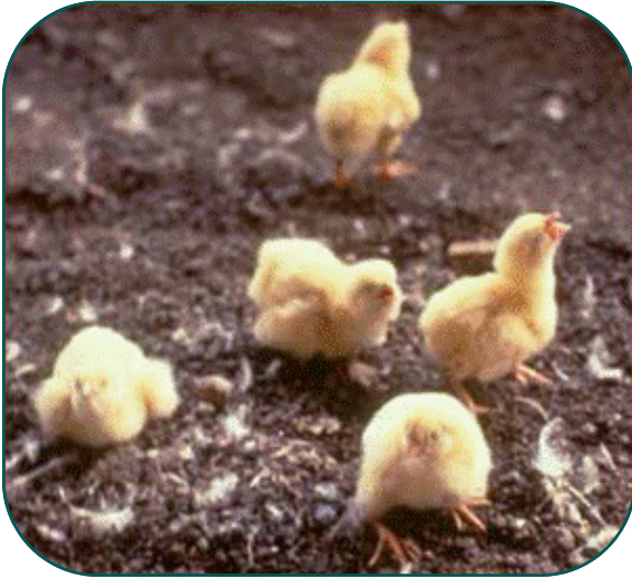
Left: Young broiler chickens gasping and mouth breathing due to airsaccullitis and E. coli respiratory infection.