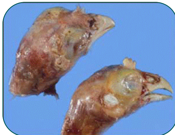
Right: Heads of two broiler chickens with skin removed to demonstrate the yellow exudate under the skin (cellulitis) caused by E. coli infection.